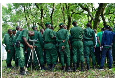
Left: The Dja River, Cameroon (East/South))