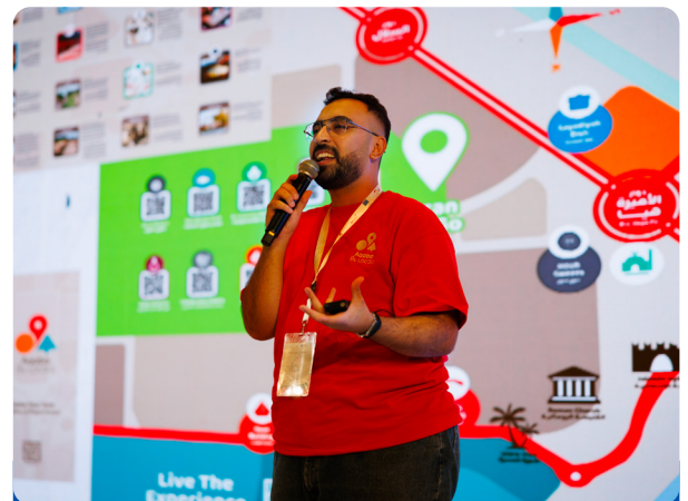
Entrepreneur Pitching His Startup

The entrepreneurial ecosystem also faces numerous challenges. The framework conditions are often not conducive to entrepreneurs. Administrative hurdles and bureaucratic processes act as obstacles. Furthermore, there are insufficient support and cooperation offerings in the regions. As a result, entrepreneurs are unable to fully leverage local markets in the governorates and business potentials.