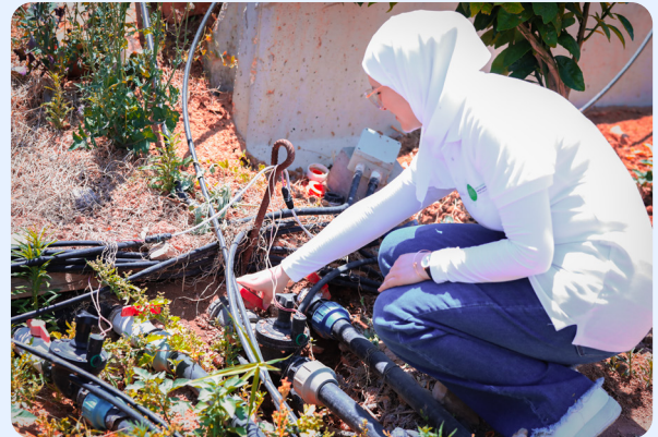
Female Entrepreneur Testing Product Prototype

E4DE organises hackathons, acceleration programmes, and other initiatives with a particular emphasis on supporting women-led businesses.