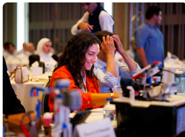
Judges at the Regional Entrepreneurship Ambassador Contest

To realise its ambition, E4DE follows a holistic approach and operates on three levels – macro, meso and micro - and effectively engages with all relevant stakeholders. It collaborates with national and local ecosystem stakeholders across Jordan and works directly with entrepreneurs.