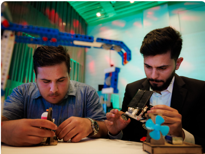
Entrepreneurs showcasing their product