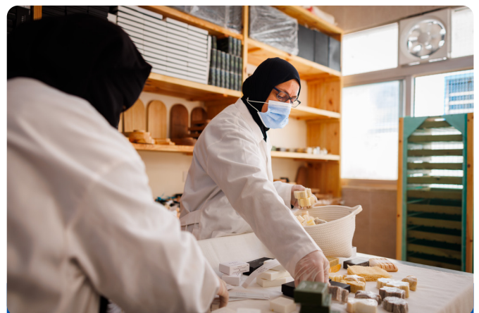
Women Entrepreneurs Crafting Natural Soap

Business ideas are identified and aligned with market needs through sector-specific workshops. The focus is on addressing gaps in products, services, and value chains specific for each governorate. Additionally, startups are connected with established companies, either as mentors or potential buyers of their products and services.