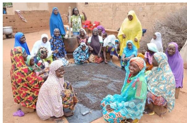
Members of a local women's group in the process of making "Soumbala", a traditional West African condiment.