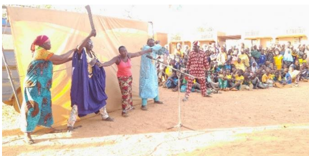
Students in Kongoussi participating in an awareness session on welcoming and supporting their displaced classmates.

The activities on economic recovery are co-financed by the EU and executed in consortium with the Belgian Agency for Development Cooperation (Enabel).