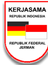
Indonesian - German Development Cooperation