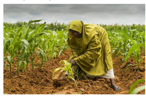
A woman in a field planting