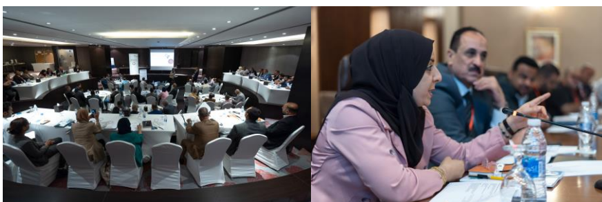
Photos: Workshops and exchange events between national and sub-national levels organised by GIZ.