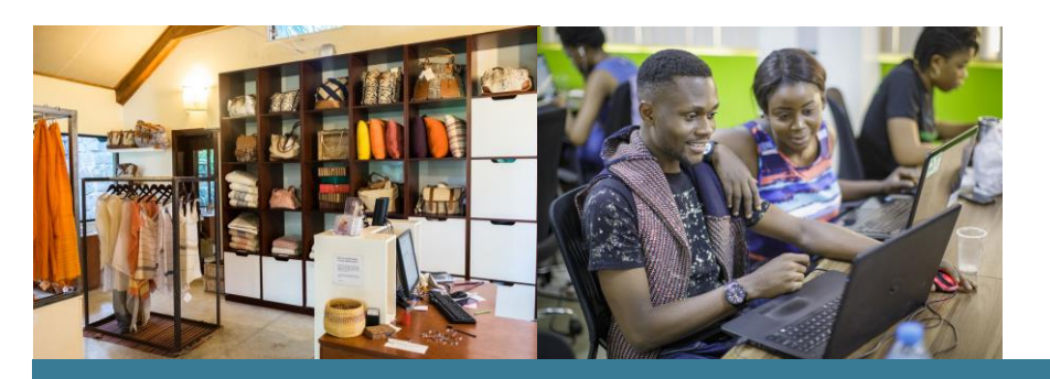
L. to r.: Sustainable textile shop; Co-Creation digital capacity trainings.

The project supports MSMEs to participate in e-Commerce. To achieve this, it is forming partnerships with private companies and intermediary institutions in Ghana, Kenya, Nigeria and Rwanda to deliver practice-oriented training courses for MSMEs. The project has a particular focus on companies led by women in all of the training measures it supports. In cooperation with relevant stakeholders, it is also exploring innovative ways along the e-Commerce value chain to reduce negative impacts on the environment ("greening e-Commerce"). In Ghana, for instance, the project partnered with a