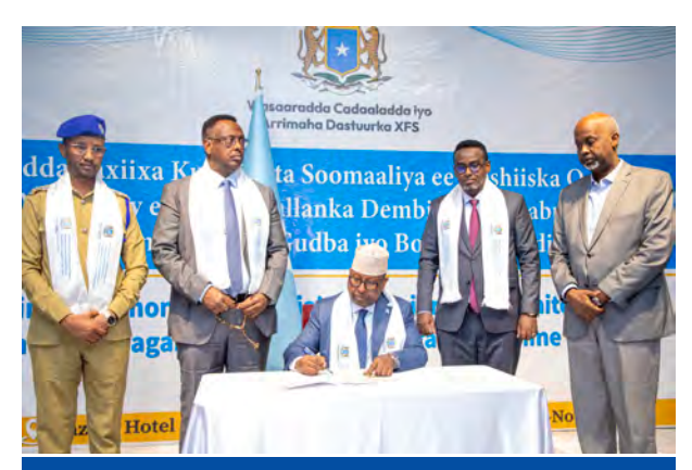
Somalia ratifying UNTOC - a significant step in the fight against transnational organised crime

In a landmark move, Somalia ratified the UN Convention against Transnational Organised Crime (UNTOC) in 2024, following a roadmap developed by the Ministry of Justice with BMM's support. The programme further supports the implementation of UNTOC and the development of regulations to allow for the application of the law by practitioners. Additionally, two technical Task Forces on Return & Reintegration and Trafficking & Smuggling with representation from the federal member states