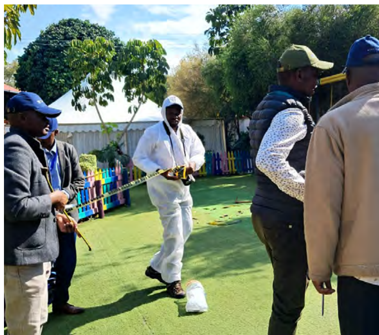
Multi-agency simulation-based training for improved investigation of cases of trafficking in human beings

In cooperation with the Counter-Trafficking in Persons (CTIP) Secretariat and CSOs, BMM provides training for relevant governmental and non-governmental actors on the national referral mechanism to facilitate the referral of migrants to appropriate services, such as shelter, legal aid, medical services and psychosocial support.