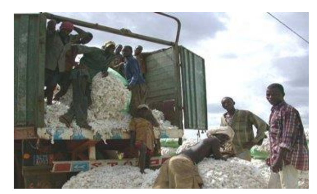
Harvested cotton in Subsaharan Africa

Strengthening the climate resilience of smallholder cotton farmers through sustainable innovations