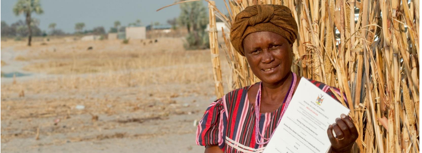
Smallholder farmer in Namibia presents legal land title.