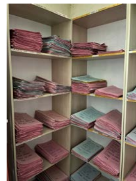
L. to r.: Beneficiaries showing their landtitles; a written registry of certificates; a storage room containing certificates