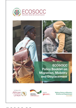
ECOSOCC Policy Booklet on Migration, Mobility and Displacement

Revised Migration Policy Framework for Africa and Plan of Action (2018 – 2030)