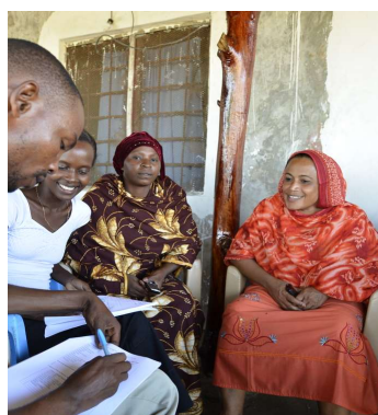
L. to R.: SGBV training and stakeholders’ meeting, DRC & Registration and access to healthcare services, Tanzania.