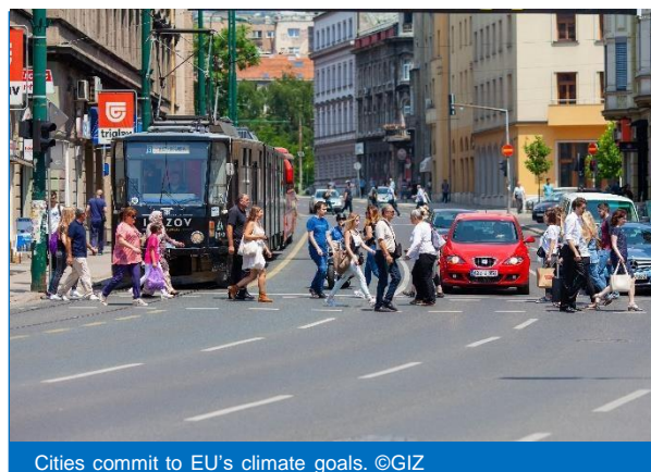
Cities commit to EU's climate goals.

The action directly benefits the cities and municipalities as well as municipal associations and the municipal administrations in the participating countries, including their staff.