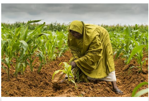
A woman in a field planting