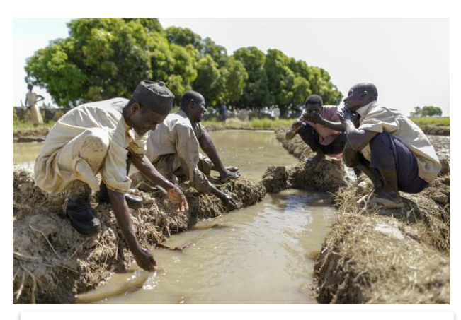
A group of men working in a field

These have all led to limited opportunities for income generation and diversification, ultimately affecting the livelihoods security of the population.