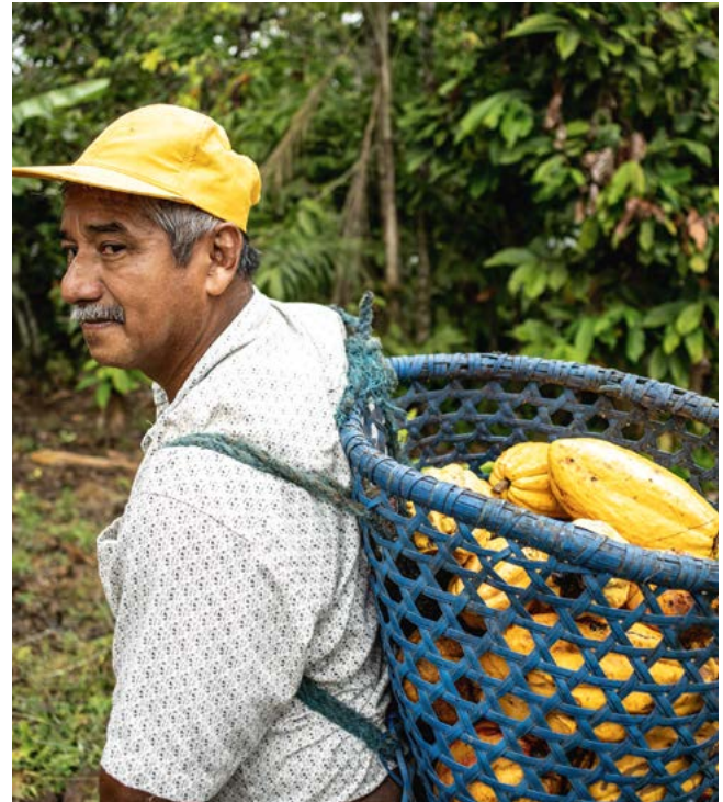
↑ At the cocoa harvest, here in Latin America.

To halt this trend, new economic practices are needed alongside effective nature conservation. The economy must become “green”, which requires incentives and capital. The eco.business Fund is an instrument that works towards this goal and promotes economic activity that contributes to the sustainable use of raw materials and the preservation of biodiversity. It also helps to mitigate climate change and adapt to its negative impacts. The fund was established in 2014 by KfW Development Bank on behalf of the Federal Ministry for Economic Cooperation and Development (BMZ) together with Conservation International and Finance in Motion.