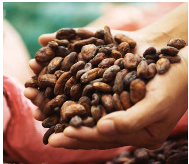
↑ Cocoa beans: they come from inside the fruit.

The eco.business Fund promotes economic activity that contributes to the sustainable use of raw materials and the preservation of biodiversity.