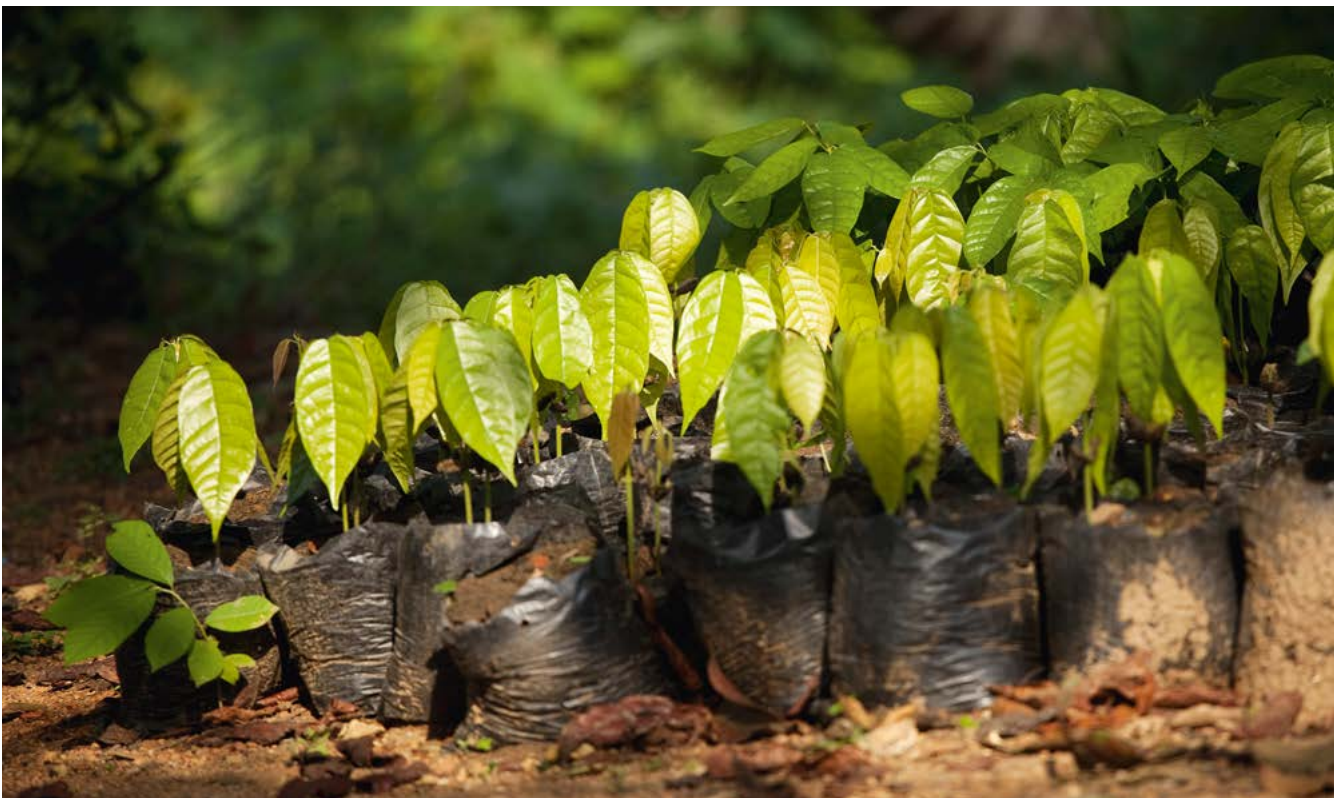
↑ Cocoa seedlings from Africa, the main region for growing cocoa next to Latin America.

Africa's economic growth and its increasing demand for food must be reconciled with environmental principles.