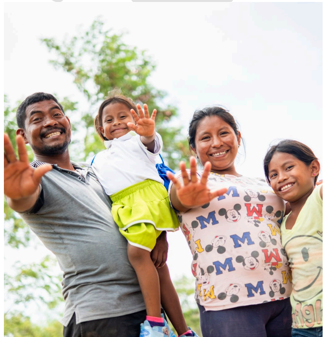
A family who participated in awareness sessions on hygiene topics