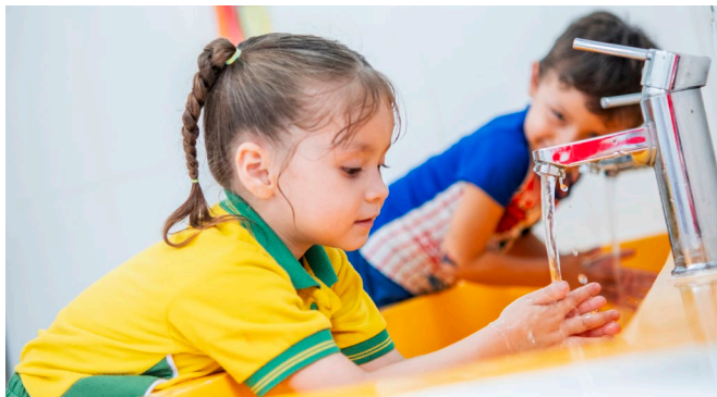
Awareness sessions on the Global Handwashing Day