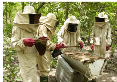
Extraction of honey, Tchamba Prefecture, Togo

FLR interventions across F4F regions have stimulated socio-economic development through diverse capacity-building efforts and the creation of small enterprises, aiming to enhance local economies and community welfare. The project's activities have generated employment opportunities in various sectors, including bamboo processing, seedling production, beekeeping, and vanilla cultivation. Training in sustainable agricultural practices and agroforestry, conducted in Ethiopia, Togo, Madagascar, Cameroon, and Côte d'Ivoire, is designed to improve local skills and empower communities. Notably, the further development of honey value chains in Togo, Benin, Ethiopia and Cameroon aims to enhance income, with emphasis on including women and young people in entrepreneurship. Additionally, Côte d'Ivoire's project is diversifying cocoa plantations through agroforestry, which is expected to further improve producer sales and sustainable income opportunities.