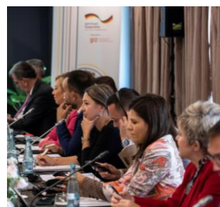
Regional Conference on the Effective Role of Parliaments in EU Integration Process