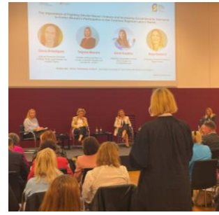
Gender Equality Forum within the Berlin Process 2024