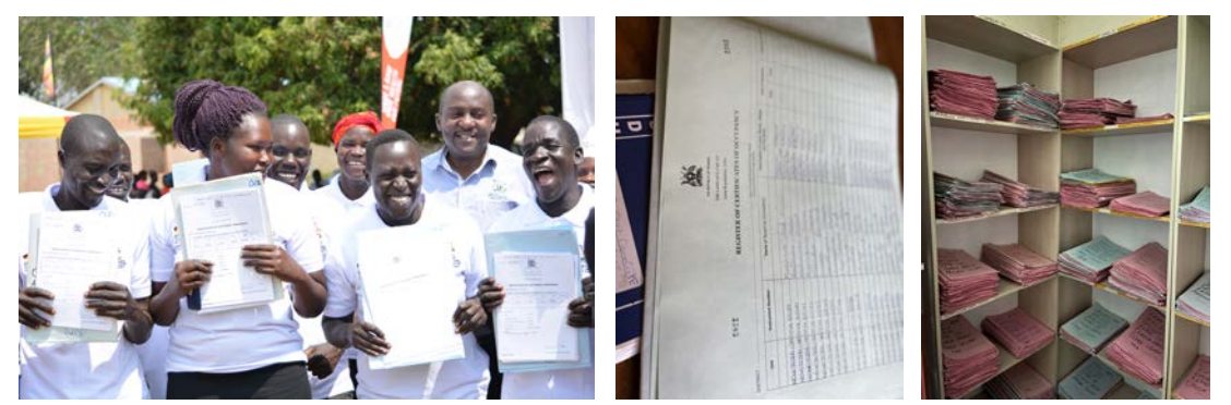
L. to r.: Beneficiaries showing their landtitles; a written registry of certificates; a storage room containing certificates