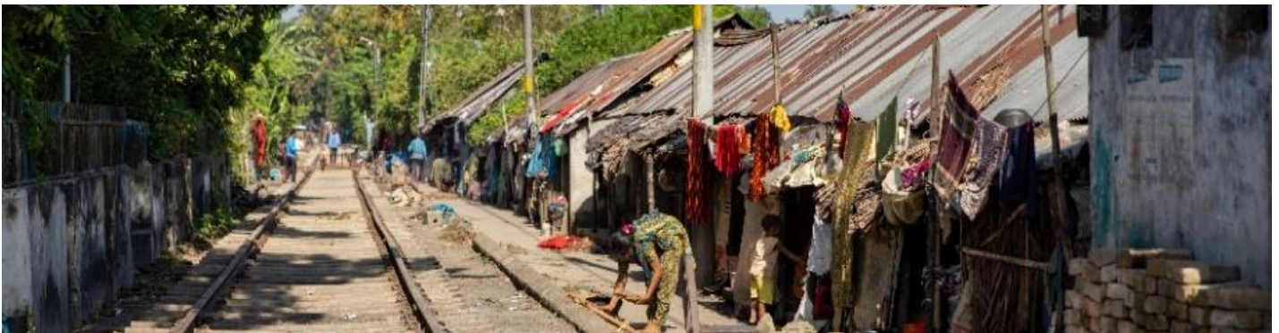
Life in the informal settlements in Rajshahi