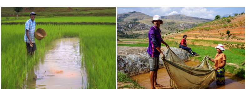
Photo left: A fish farmer feeding fish in a rice field. Photo right: Fishing with net in Haute Matsiatra.

The project adopts a three-pronged approach, combining technical and institutional interventions to build the capacity of fish farmers and producer groups, while supporting the updating of the regulatory framework for the sector's sustainable development. To facilitate the spread of fish farming and increase the availability of aquatic products in the target areas, the project strengthens the capacity of small-scale fish farmers and fry breeders. The intervention aims to increase fish production and make it easier to market on local markets. The goal is to help improve local livelihoods and meet the demand for highly nutritious food.