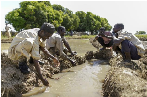
A group of men working in a field

These have all led to limited opportunities for income generation and diversification, ultimately affecting the livelihoods security of the population.