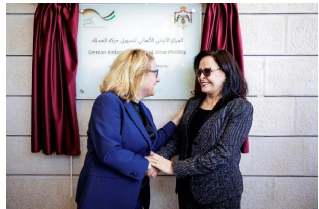
Federal Minister for Economic Cooperation and Development Svenja Schulze and Jordanian Minister of Labor Nadia Al-Rawabdeh at the opening of the centre in Amman, Jordan.

The centres are also available to people who have returned from Germany, Europe, or other countries, and need support with social and economic reintegration on site. The centres place a particular focus on women.