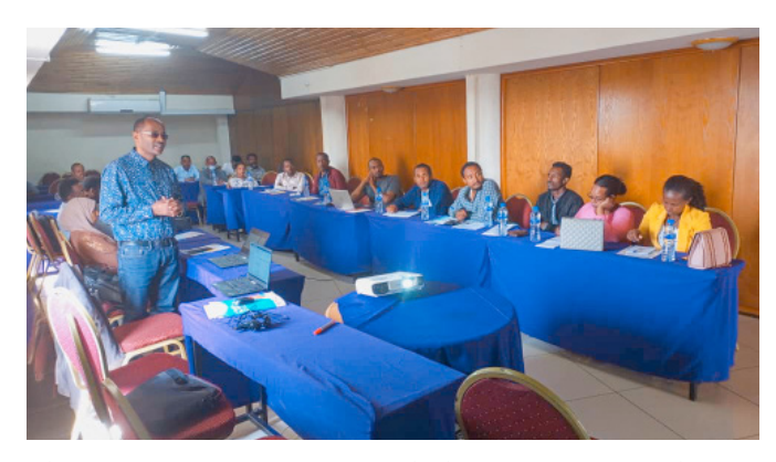
The S.I.C. project supported the Environmental Protection Authority (EPA) to develop sludge management guideline and formulation of national sludge standard

and management tools which were endorsed by the state council in April 2022. Following that EPA and S.I.C project organized two round awareness creation workshop at Adama and Hosaena for inspectors, environmental law clinks, universities, environmental compliance officers and other stakeholders to enhance the compliance and enforcement capacity of the authority and implementation of sludge standard. The workshop familiarizes the participants with the newly endorsed sludge standard and sludge management tools, Environmental impact assessment proclamations, hazardous waste management proclamations and other relevant environmental procurations and regulations.