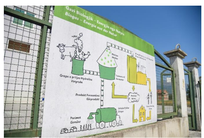
Waste as a renewable source of energy. GIZ, Arbnora Memeti

Furthermore, a lack of skilled labor - force which can serve to the needs of start-ups, or benefit and promote the start-up landscape, was mentioned by the respondents as a barrier to growth.