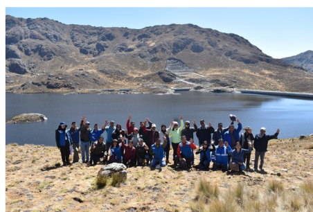
Photos: Left: Representatives of Sunass in Honduras learning about the experience of rural sanitation. Right: Representatives of ERSAPS and AHPAS in the Mariño – Abancay basin, Peru, learning about the experience of water source conservation.